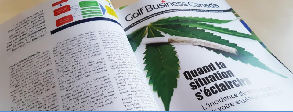
Golf Business Canada